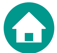
Housing and utilities