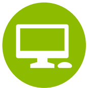
Computers and tablets

The following examples of allowances, expenses, and reimbursements cannot be included as PERA salary: