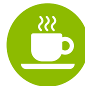
Food and beverage