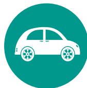
Automobiles and mileage