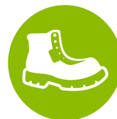
Uniforms and clothing