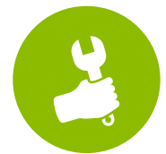
Tools and supplies