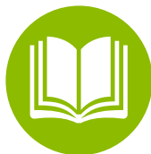
School supplies and books